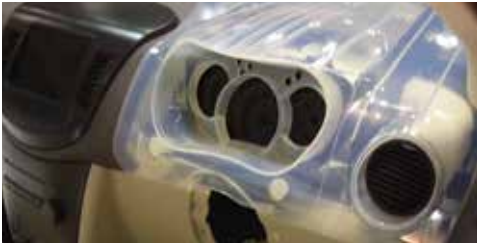
Various Accura materials for form and fit tests of a dashboard

Plastic and composite parts made from Accura SLA materials are the industry's "gold standard" for accuracy, providing excellent resolution, surface finish and dimensional tolerances. Accura SLA materials offer the broadest choice of materials in 3D printing and can easily be optimized for specific prototyping, casting, tooling and direct manufacturing applications.