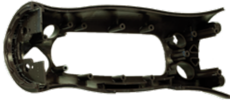
Visijet SL Black

The wide range of Visijet SL engineered materials offers the toughest and the highest quality parts to meet a broad range of commercial and production applications.